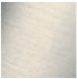
platinum matte 36 315 980-06

More custom finish options are available via special production (xTra Service). Please see our finish matrix for availability and pricing or contact a Dornbracht representative.